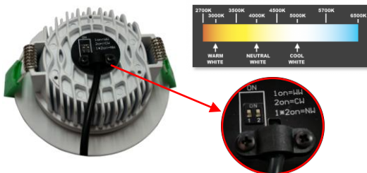
Set the required colour via the switch before installing