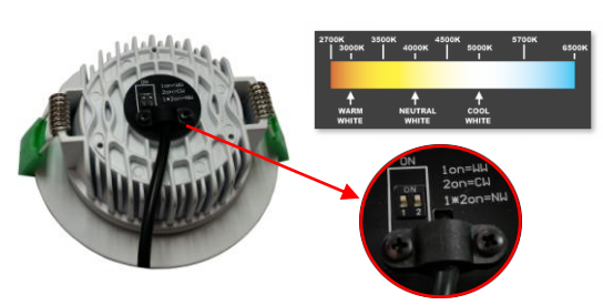
Set the required colour via the switch before installing