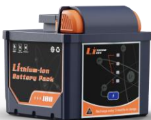
PLT-BP D24-100 Lithium-Ion Battery The PLT-110 accepts 1 battery pack