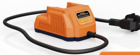
PLT-BC1 Single Bay Charger Charge 1 battery