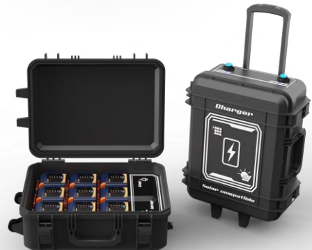
PLT-BC9 9 Bay Rapid Charger Travel case rapid charger supports 2-9 batteries