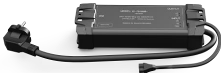
PLT-AC AC Driver Dimmable AC Driver to suit