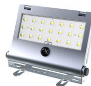
Fully portable, includes table stand