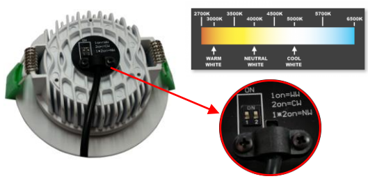
Set the required colour via the switch before installing