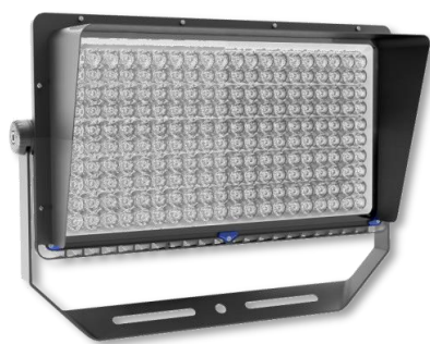
Image shown with fitted with optional cut-off hood fitted (Model: FLA-SC500-CH)